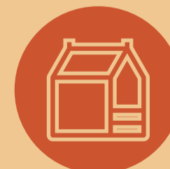
Stable and Poultry Yard